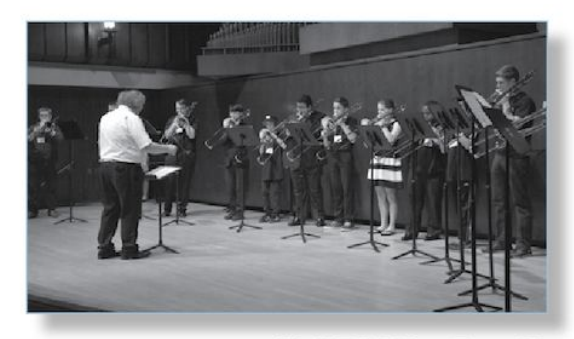
JR. ITF 2016 - Page 32