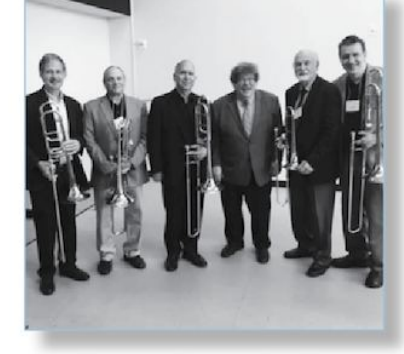
Eric Ewazen Honored - Page 7